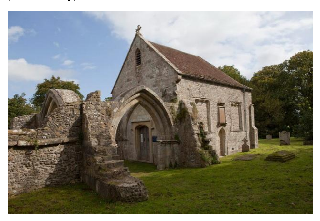
Church of St. Leonard