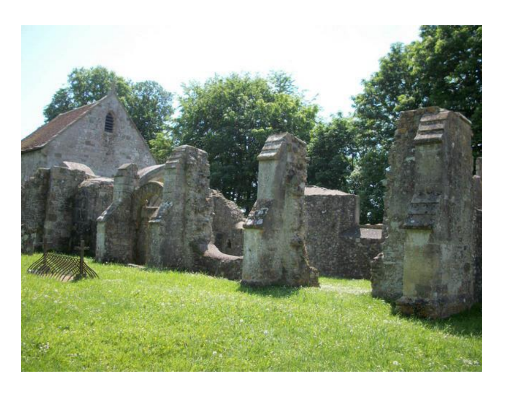
Church of St. Leonard, Sutton Veny