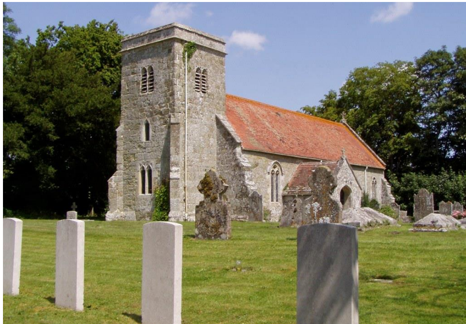
St. Edith's Churchyard, Baverstock, Wiltshire.