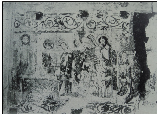
Wall paintings "of high antiquity" found in 1867

When the church was demolished in 1867, a series of wall paintings "of high antiquity" depicting the principal events in the life of Christ, were discovered beneath the plasterwork on the walls. They were coloured mainly red and yellow. Some tracings and copies of the paintings were made and even some photographs taken.