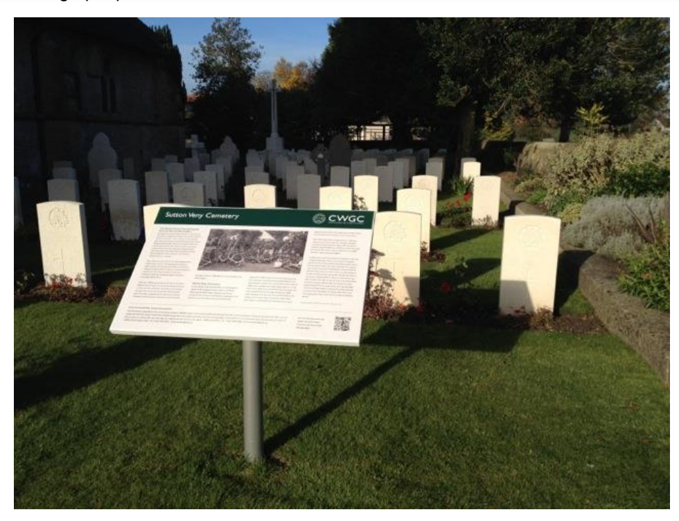
Sutton Veny churchyard, showing the information panel for visitors recently installed by the Commonwealth War Graves Commission

"The site is typical of the thousands of locations here in the United Kingdom where the Commonwealth War Graves Commission looks after war graves. It is our intention to make these places better known over the Centenary, to encourage people to visit, to learn and to remember."