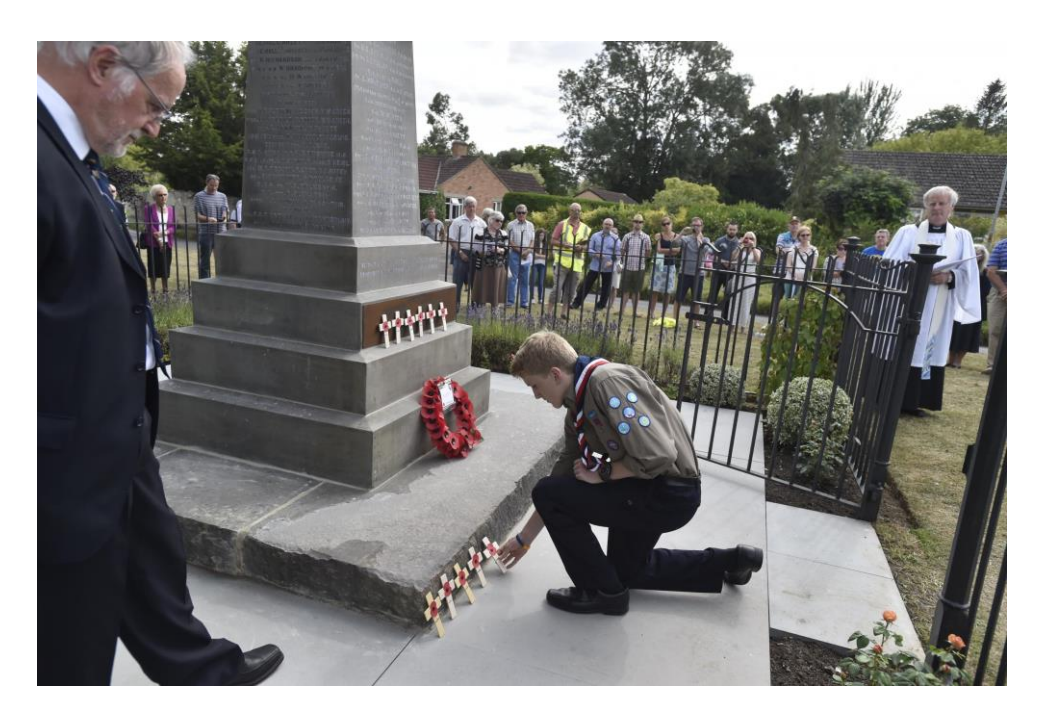
Broughton Gifford Scouts lay wreaths at the War Memorial

Residents in Broughton Gifford came together on Saturday to rededicate the newly-restored war memorial by commemorating the men who lost their lives in the First World War.