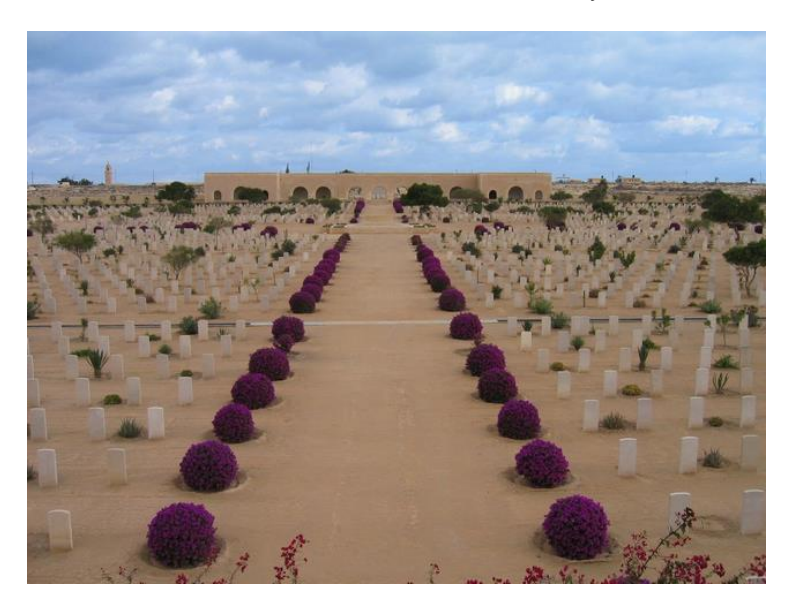
Alamein Memorial (Photos & Information from CWGC)

The Alamein Memorial forms the entrance to Alamein War Cemetery. The Land Forces panels commemorate more than 8,500 soldiers of the Commonwealth who died in the campaigns in Egypt and Libya, and in the operations of the Eighth Army in Tunisia up to 19 February 1943, who have no known grave. It also commemorates those who served and died in Syria, Lebanon, Iraq and Persia.