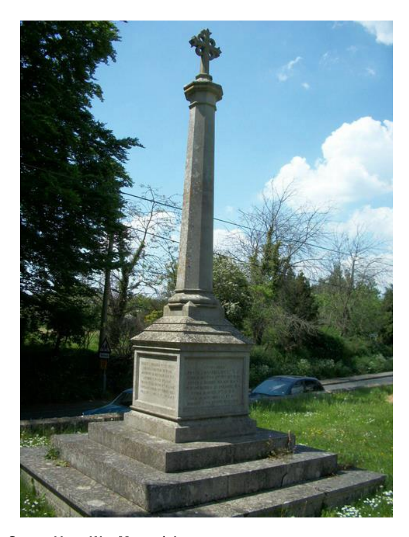
Sutton Veny War Memorial