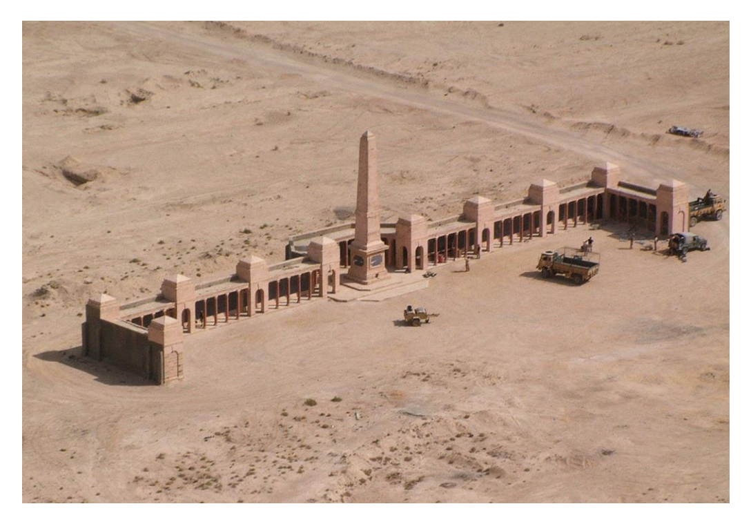
Basra Memorial, Iraq

The Basra Memorial is now located 32 kilometres along the road to Nasiriyah, in the middle of what was a major battleground during the first Gulf War. The Panel Numbers quoted at the end of each entry relate to the panels dedicated to the Regiment served with.