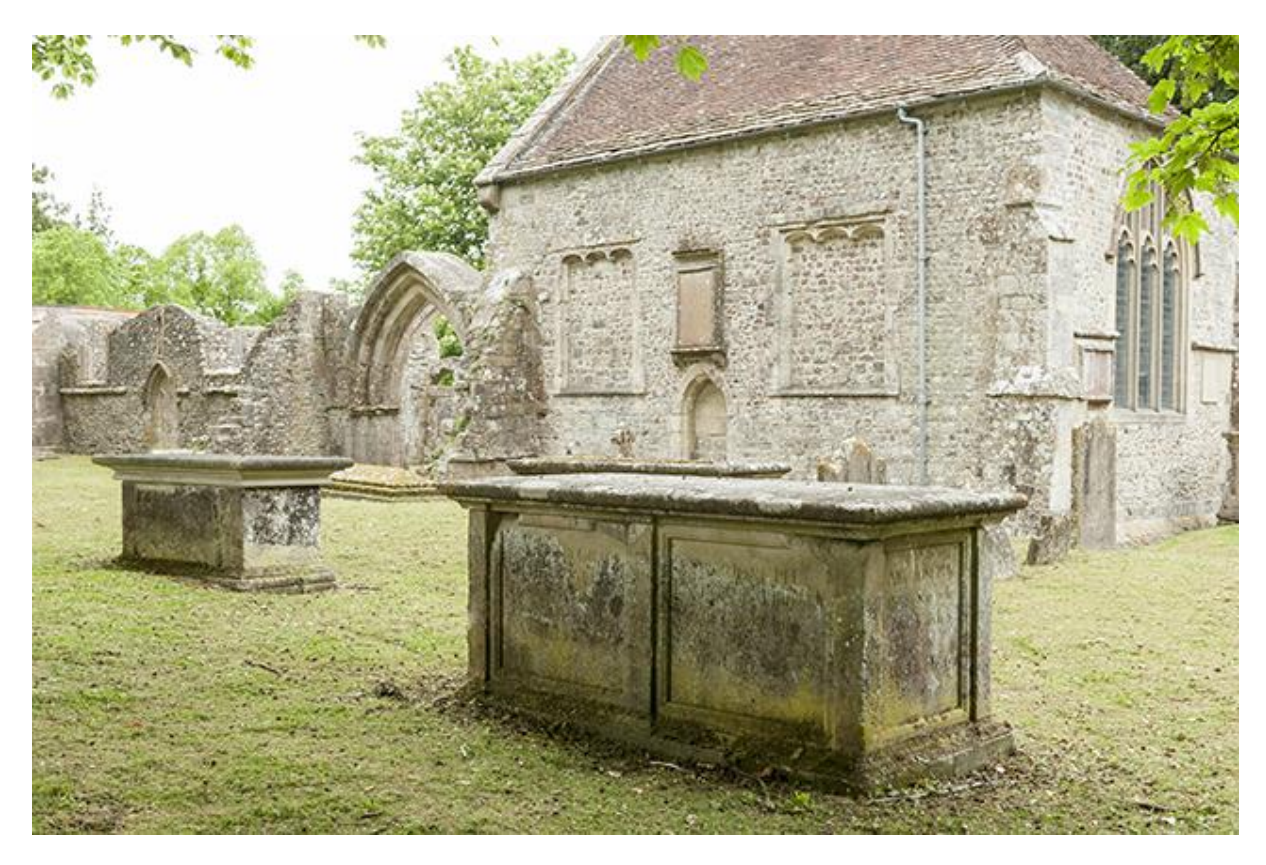
(Listed) Exton Monument - Grace & Joseph