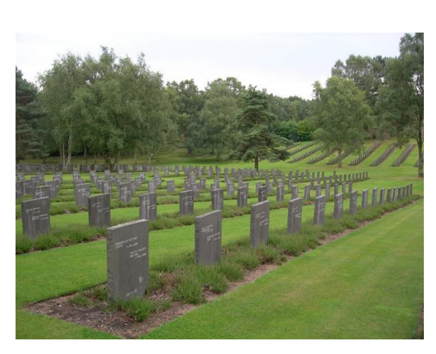
Cannock Chase German Military Cemetery