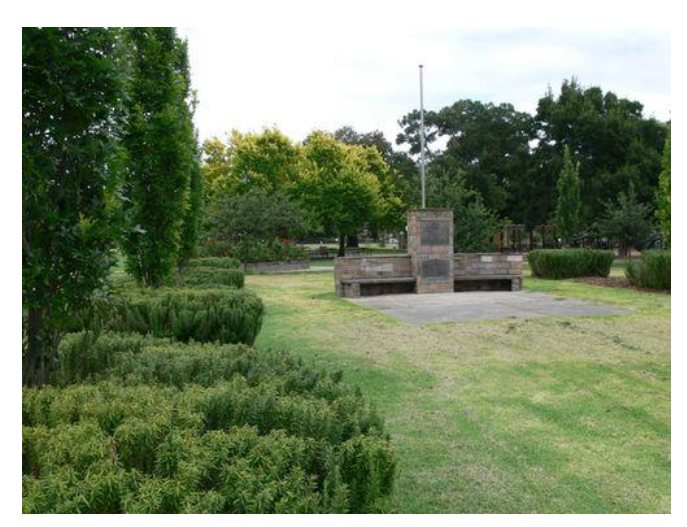
Richmond War Memorial

The Richmond War Memorial located at Barkly Gardens, Coppin Street, Richmond does not list individual names.