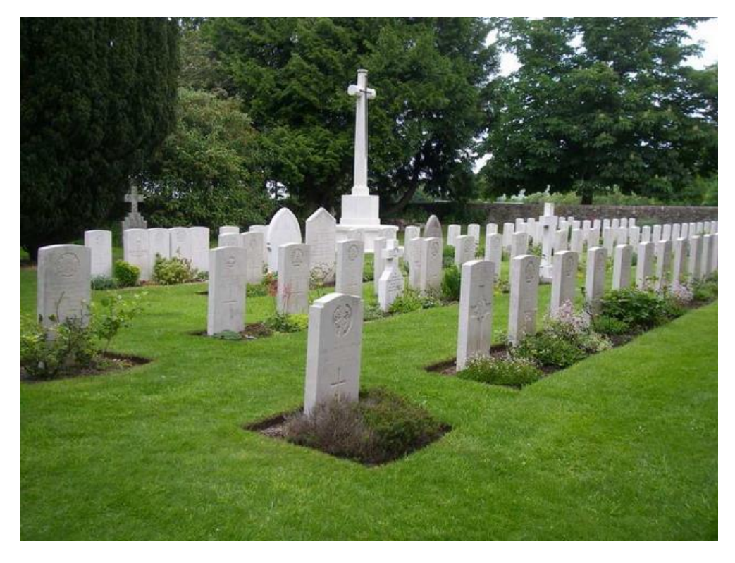
War Graves at Sutton Veny (Photos from CWGC)