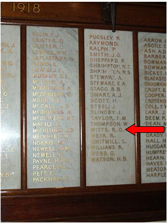
Parkes R.S.L. Roll of Honour