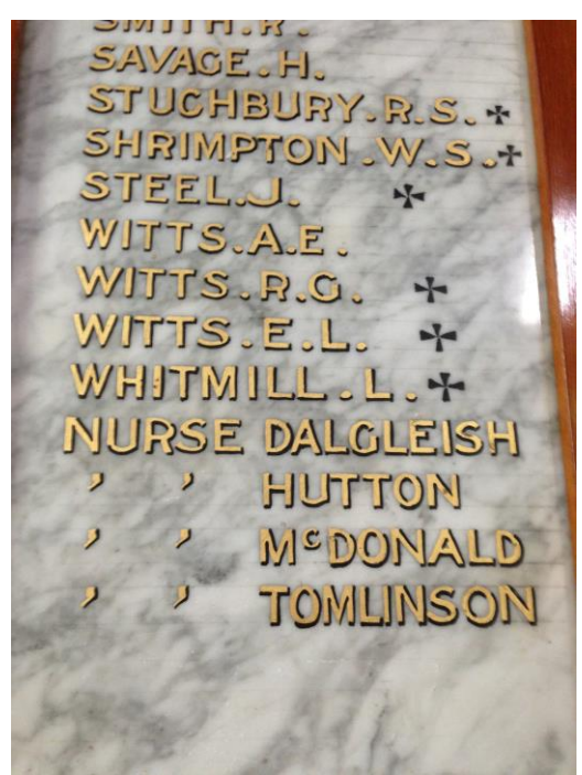
Roll of Honour Board in Presbyterian Church, Parkes