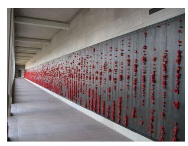
Roll Of Honour WW1 Australian War Memorial Canberra, Australia

Private R. Quick is commemorated in the Hall of Memory Commemorative Area at the Australian War Memorial, Canberra, Australia on Panel 131.