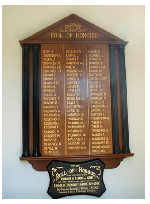
Blackheath World War 1 Honour Roll