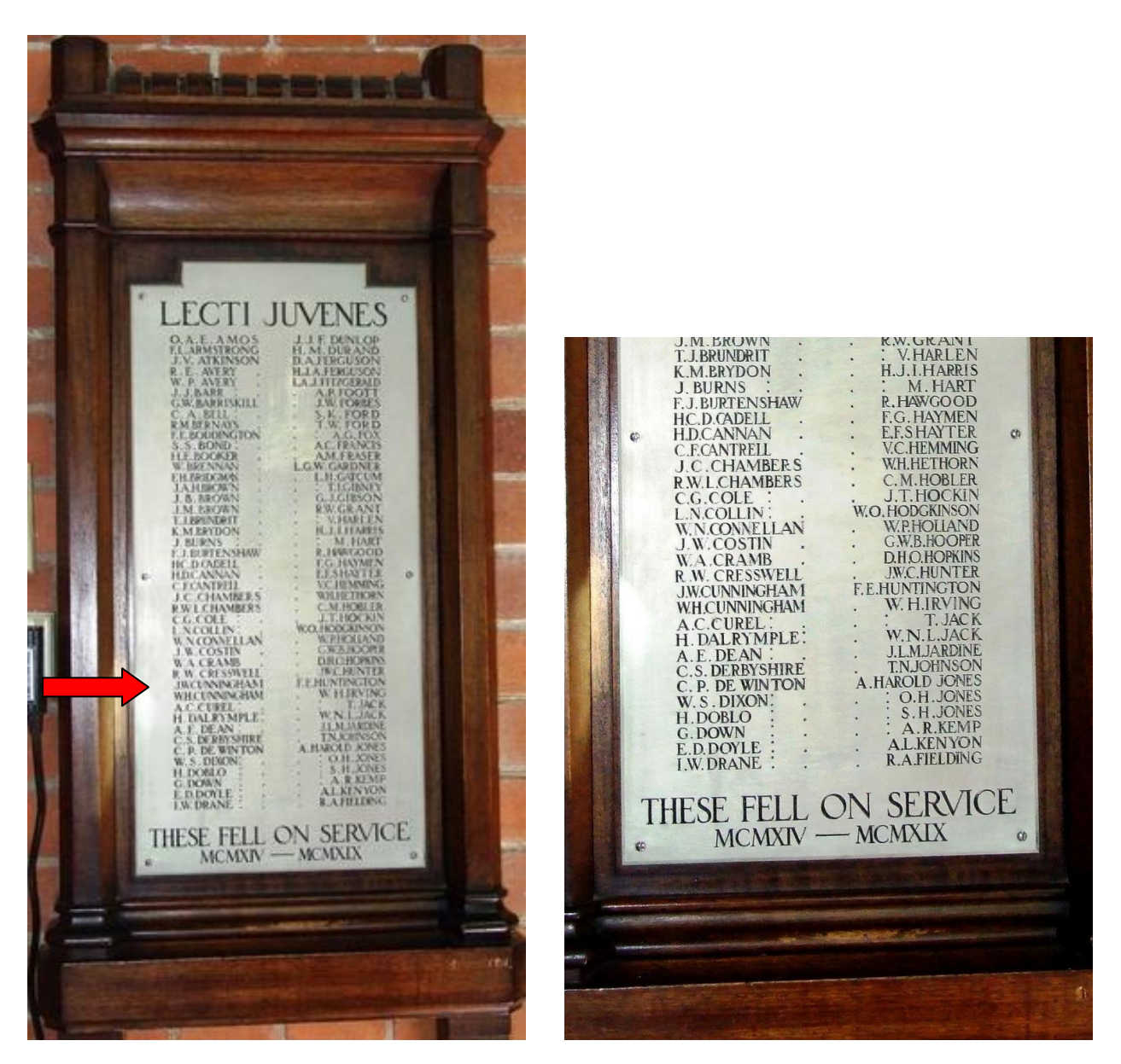
Brisbane Grammar School Memorial Library WW1 Honour Board