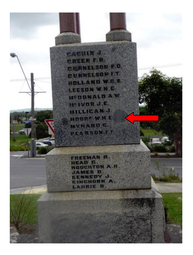
Bunyip War Memorial