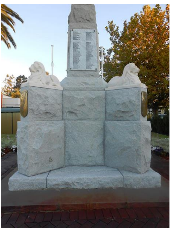
West Leederville War Memorial

An article in the local newspaper the Cambridge Post, February 21, 2015 -