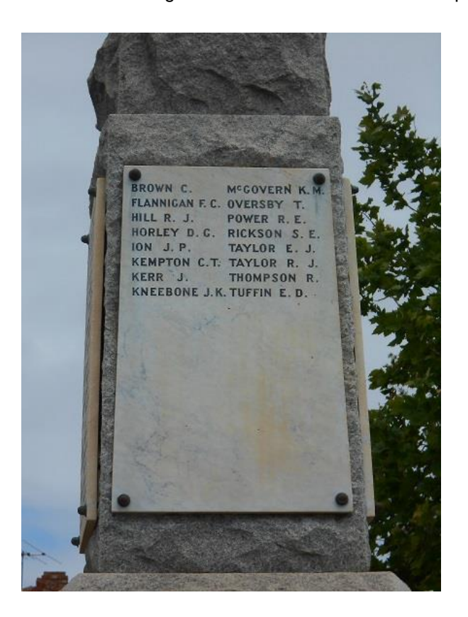
West Leederville War Memorial & the existing back panel where the additional 50 names will be added.