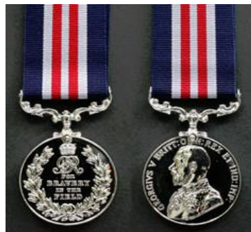
Military Medal showing both sides