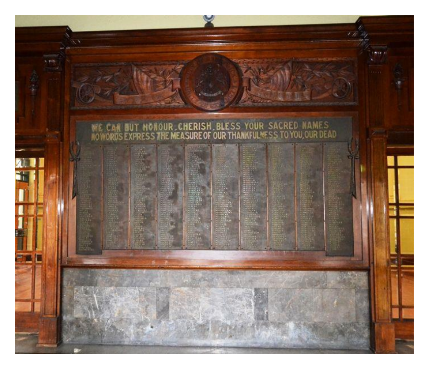
Brunswick Town Hall Honour Roll

G. Robinson is remembered on the Brunswick Town Hall Honour Roll located in Foyer of Brunswick Town Hall, 233 Sydney Road, Brunswick, Victoria.