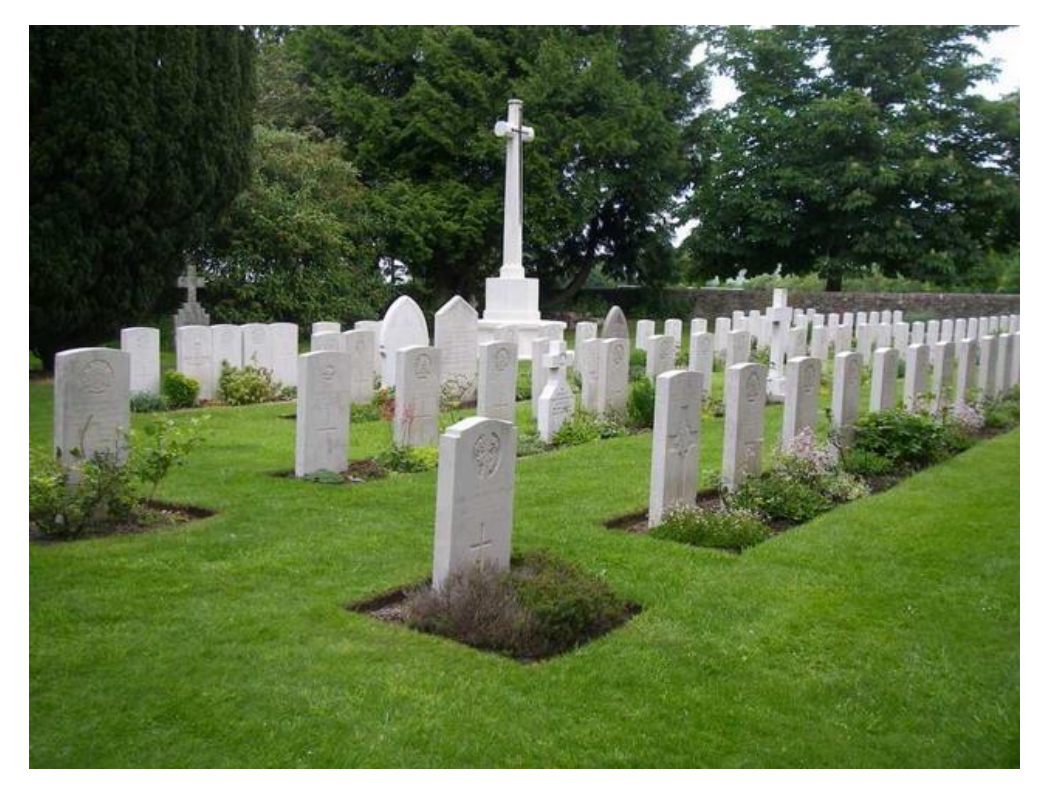
War Graves at Sutton Veny