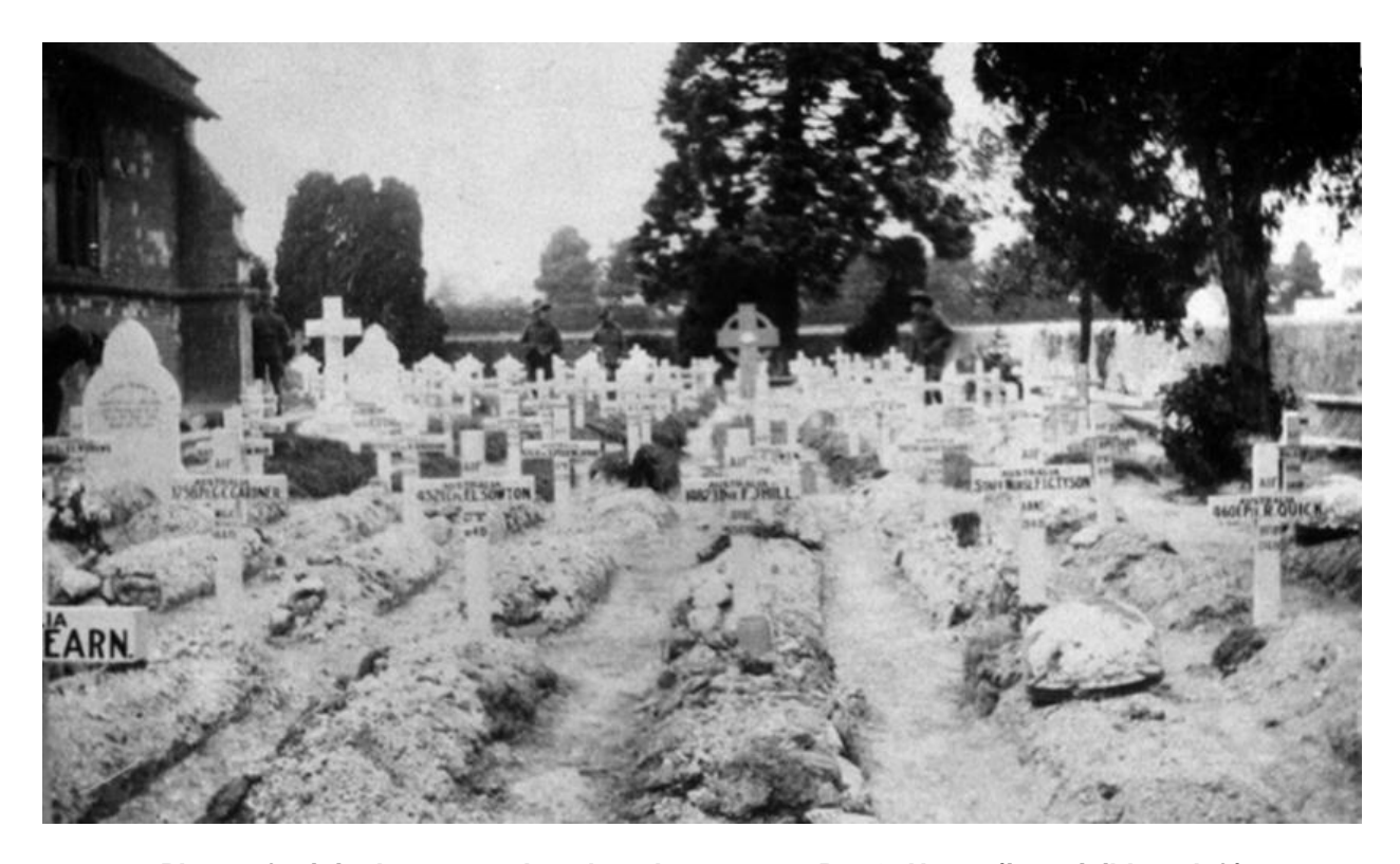
Photo of original crosses placed on the graves - Pte G. Hearn (just visible to left)