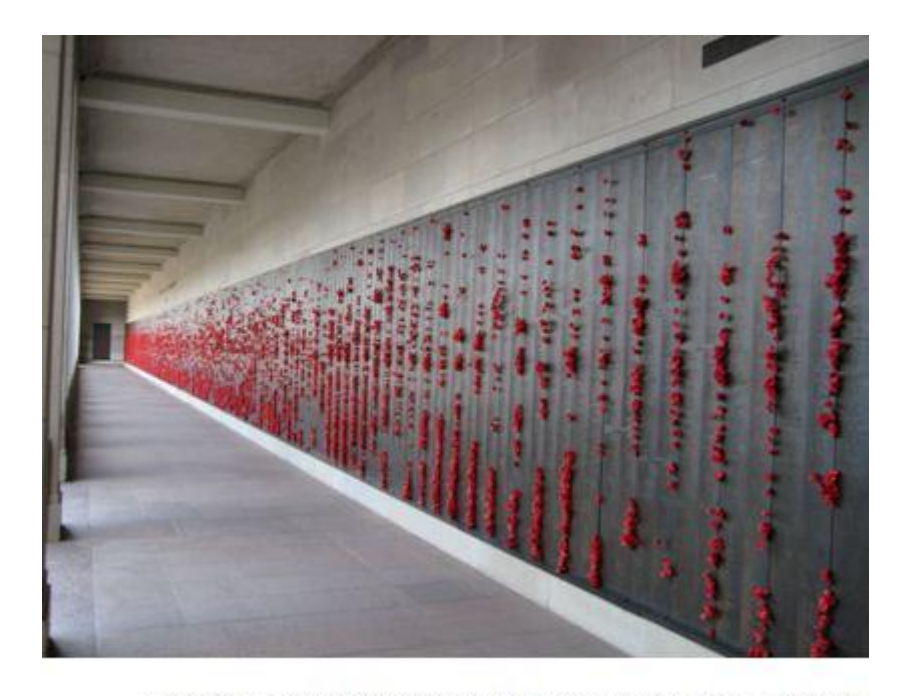
Roll Of Honour WW1 Australian War Memorial Canberra, Australia