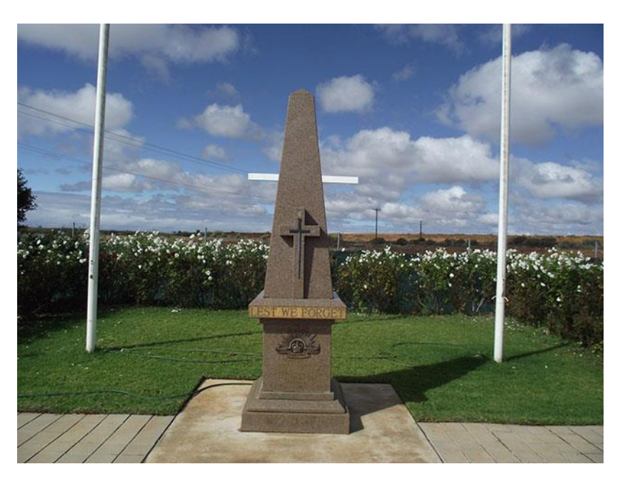
Meekatharra War Memorial