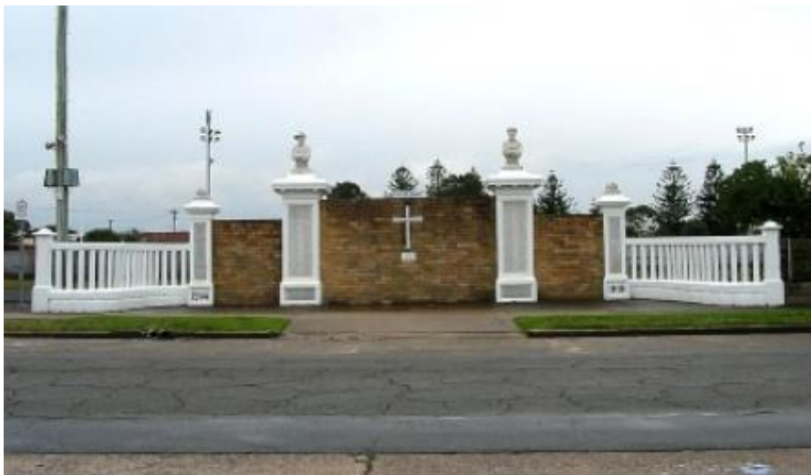
Mitchell Park, Memorial Gates at Merewether, NSW