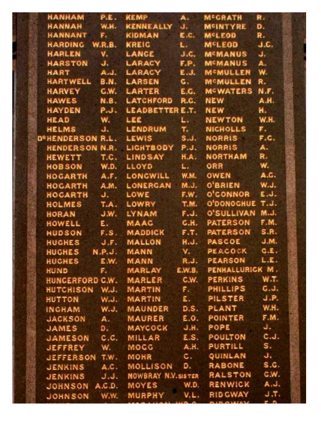
The Mothers' Memorial, Toowoomba