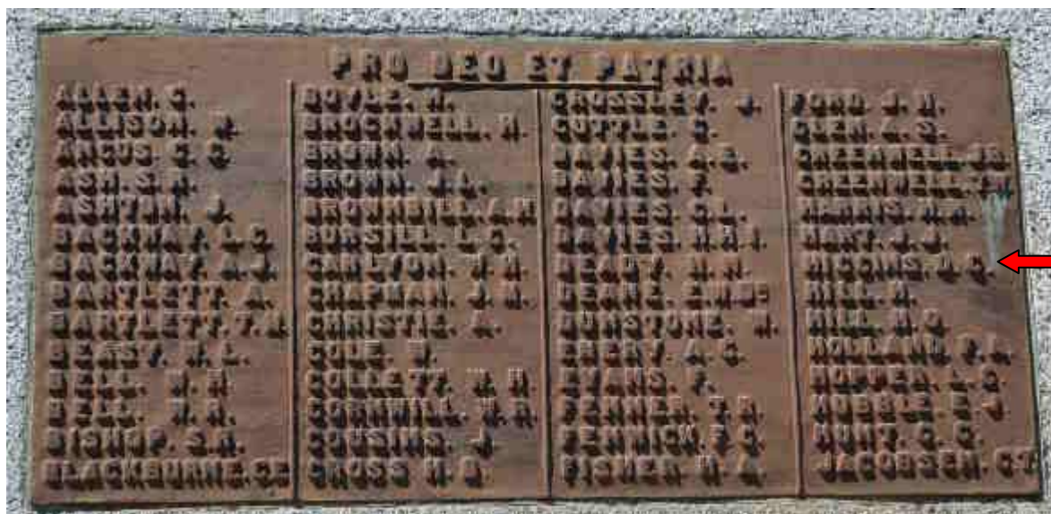
Maryborough War Memorial