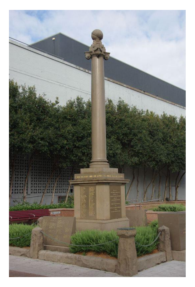
Hurstville War Memorial