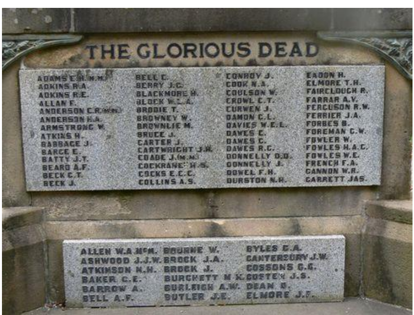
Korumburra War Memorial