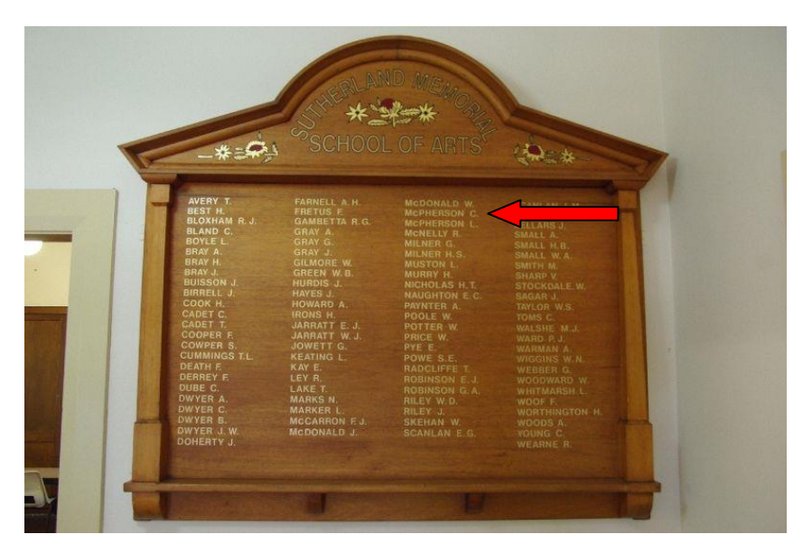
Sutherland School of Arts Honour Roll