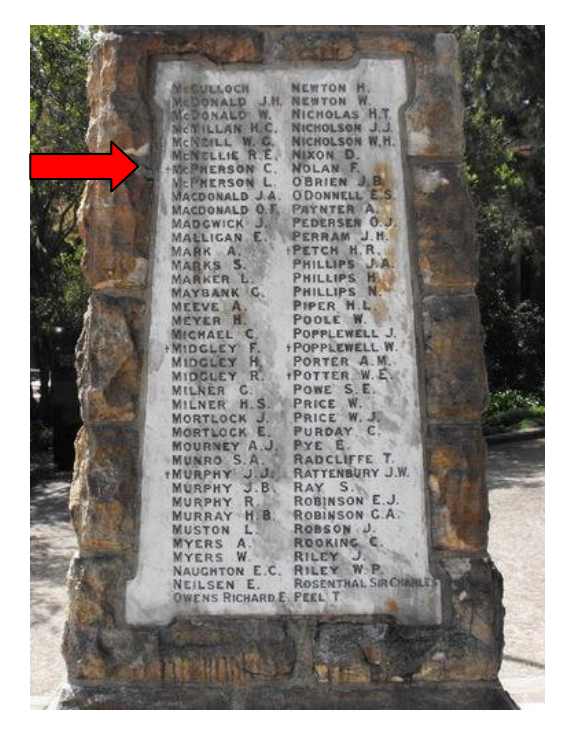
Sutherland War Memorial