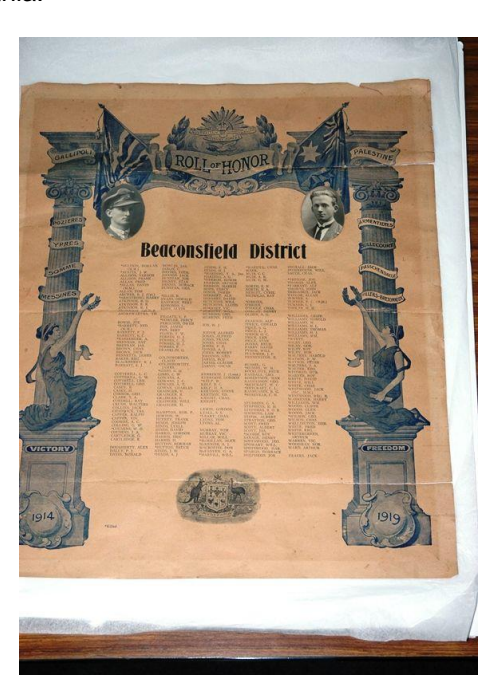
Beaconsfield District Roll of Honour

C. H. Rosevear is remembered on the Beaconsfield District Roll of Honour located in Beaconsfield Museum, West Street, Beaconsfield, Tasmania.