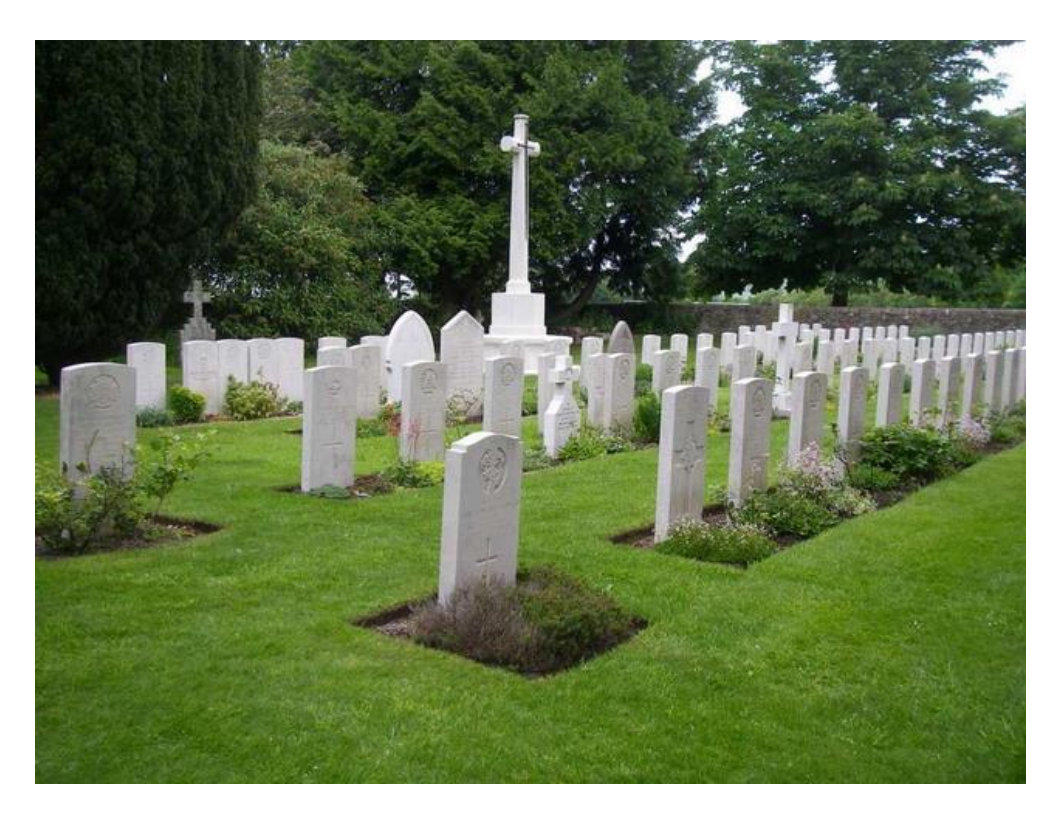
War Graves at Sutton Veny