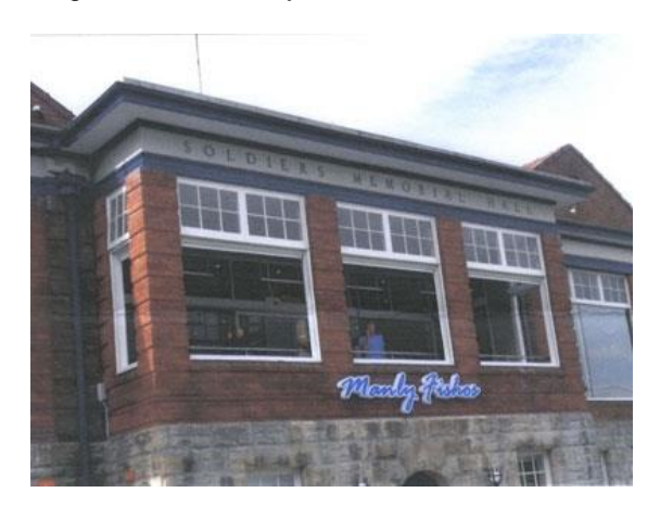
Manly Soldiers Memorial Hall Honour Roll