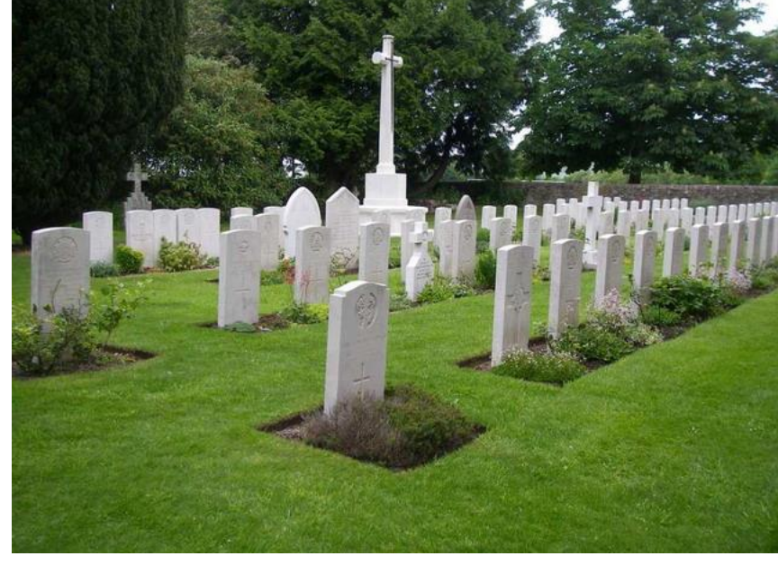
War Graves at Sutton Veny (Photos from CWGC)