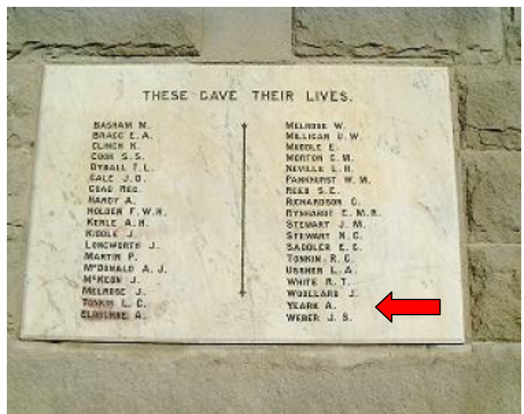
Taree World War 1 Memorial