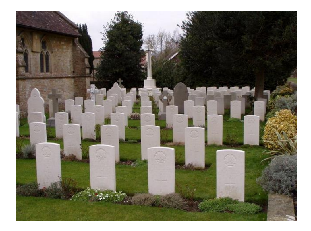
War Graves at Sutton Veny