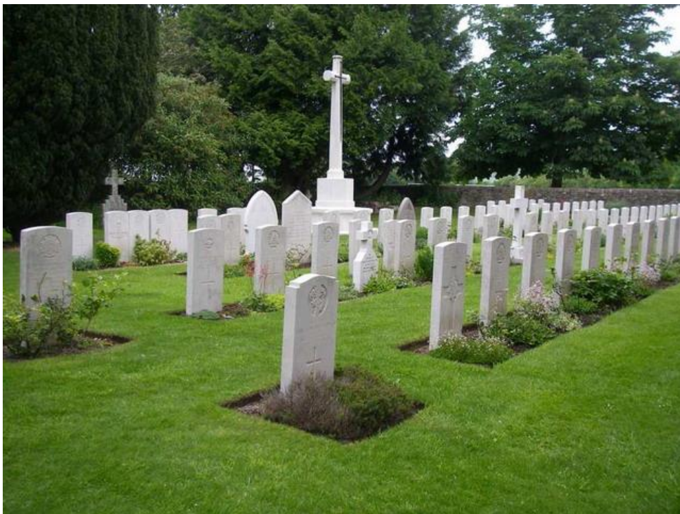
War Graves at Sutton Veny

In Proud And Loving Memory Of My Dear And Only Son