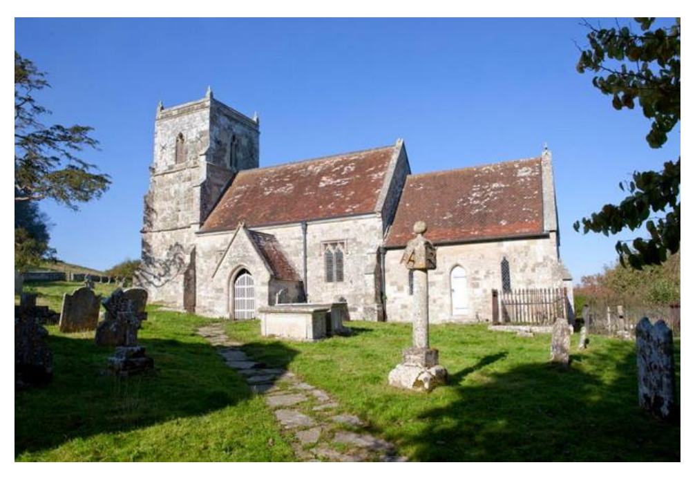
Sutton Mandeville - All Saints Church with Sundial in foreground