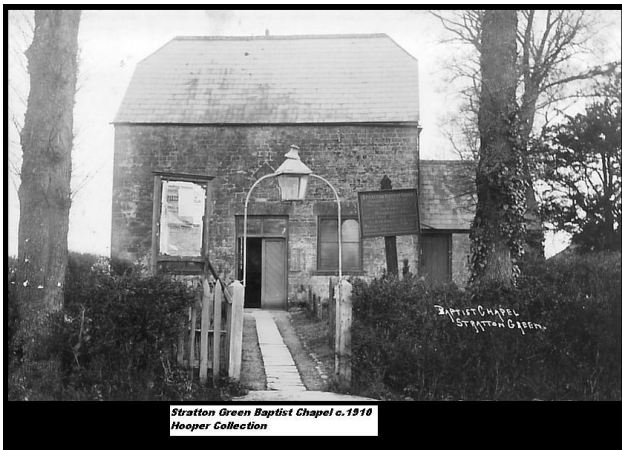
Stratton Green Baptist Chapel c.1910 Hooper Collection