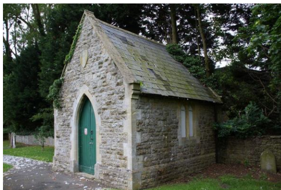
Green Road Cemetery

Built on Highworth Road next to A419 in 2004 replacing an aging chapel in Deacon Street in the town centre.