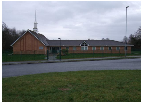
Church of Jesus Christ of Latter-day Saints (Mormons)

Built on Highworth Road next to A419 in 2004 replacing an aging chapel in Deacon Street in the town centre.