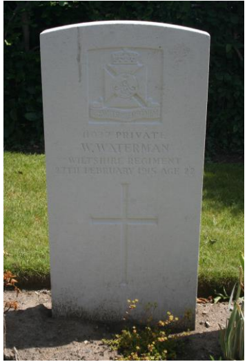
CWGC Headstone at Loker Churchyard

← Image from the Western Gazette, 12 March 1915