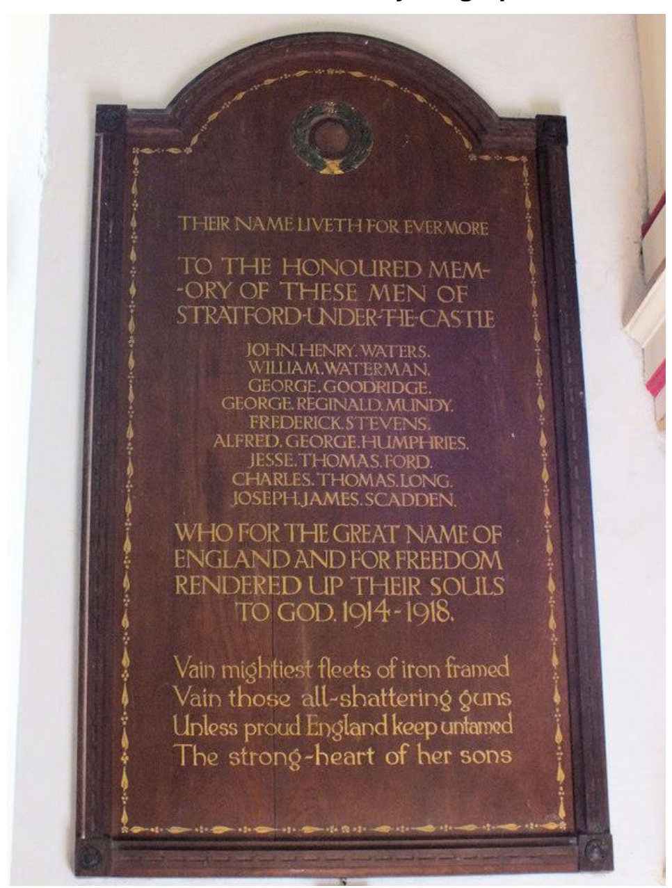
Memorial Plaque in Stratford Sub Castle Church