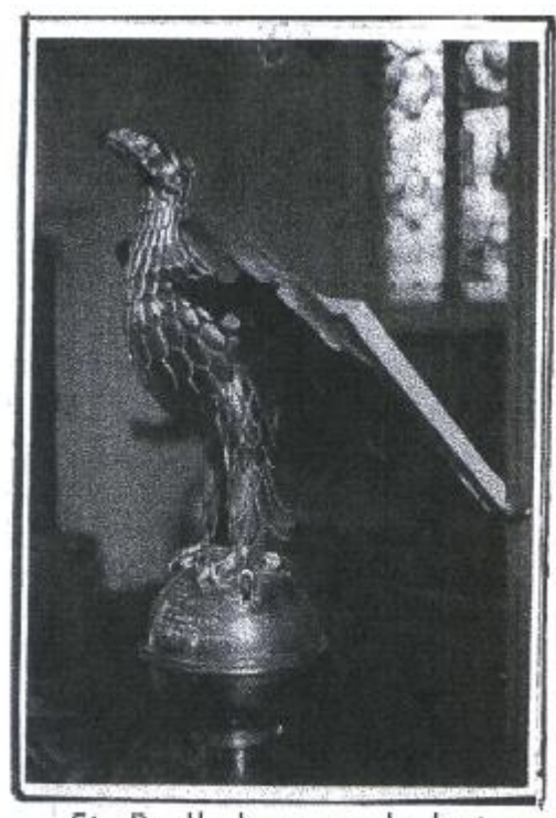
St. Paul's brass eagle lecturn and village War Memorial

The Churchs' eagle lectern, a fine example in solid brass, is located in the south east corner of the Nave, and replaced an earlier, and much smaller one, made of oak. Besides its normal church function it also represents the village War Memorial and the engraving on it reads as follows: