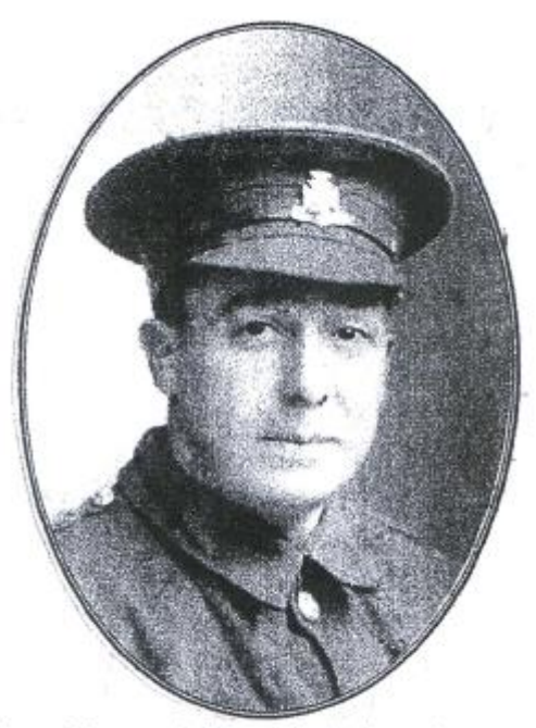
St. Paul's brass altar cross dedicated to Howard Purnell (above), a member of the Church Choir who was killed on the Somme in 1916

The altar cross, made of brass, is dedicated to one of the villages' war dead and its inscription reads: