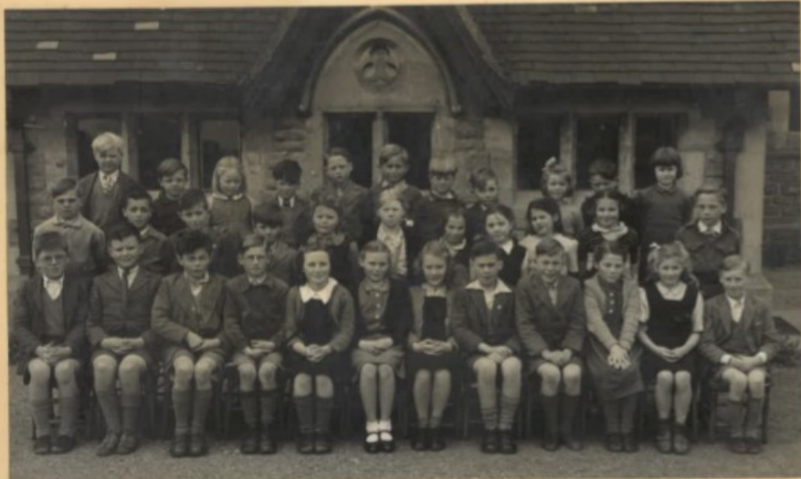
H. Tempest Ltd