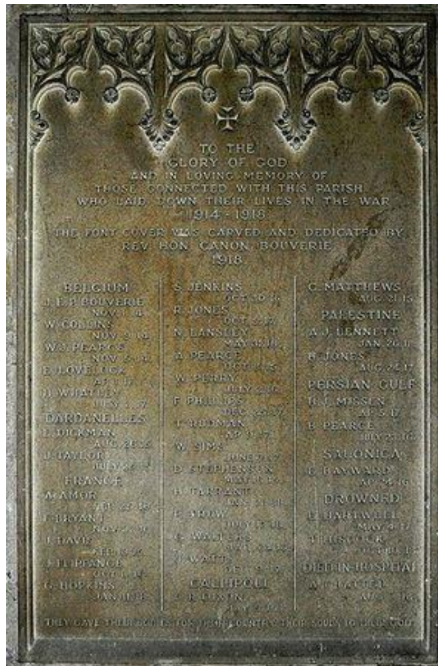
Pewsey Roll of Honour Plaque 1914 - 1918