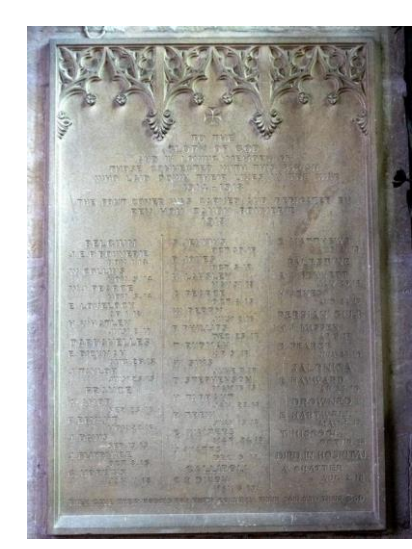
← St. John, Pewsey, Font Cover Memorial and Plaque