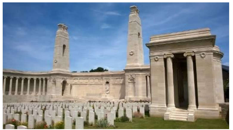
Vis-en-Artois Memorial, Pas-de-Calais, France