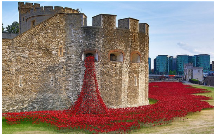
Tower of London Remembers the First World War Display 5th August – 11th November, 2014