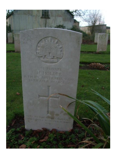
Far Left - Codford St. Mary New Churchyard with cross of remembrance

← Grave marker Codford St. Mary New Churchyard