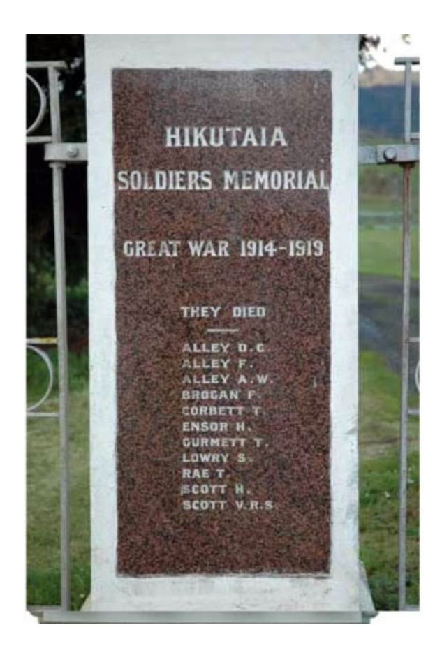
Alley War Memorial Park Gates, Hikutaia, New Zealand