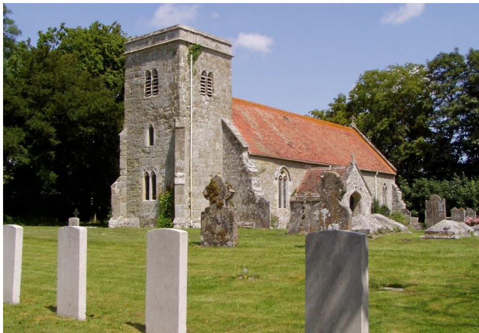
St. Edith's Churchyard, Baverstock, Wiltshire.

In Memory Of Our Dear Son. His Loving Parents. Lameroo. S.A.