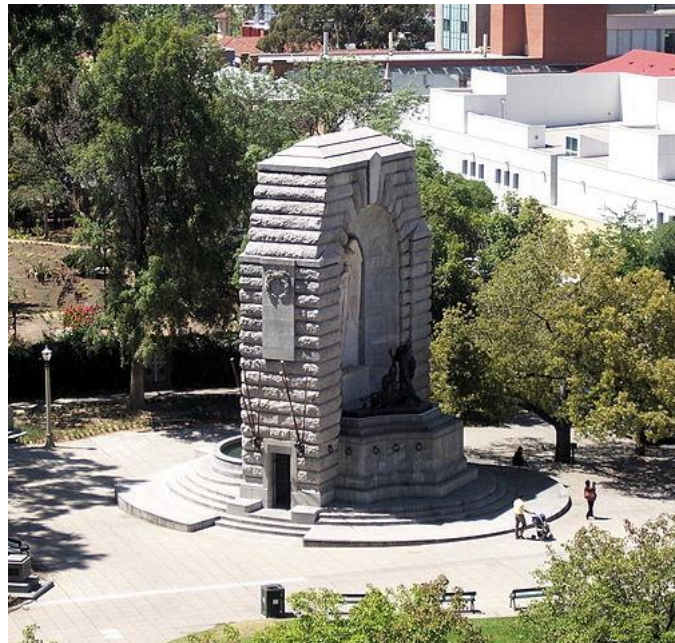
South Australian National War Memorial