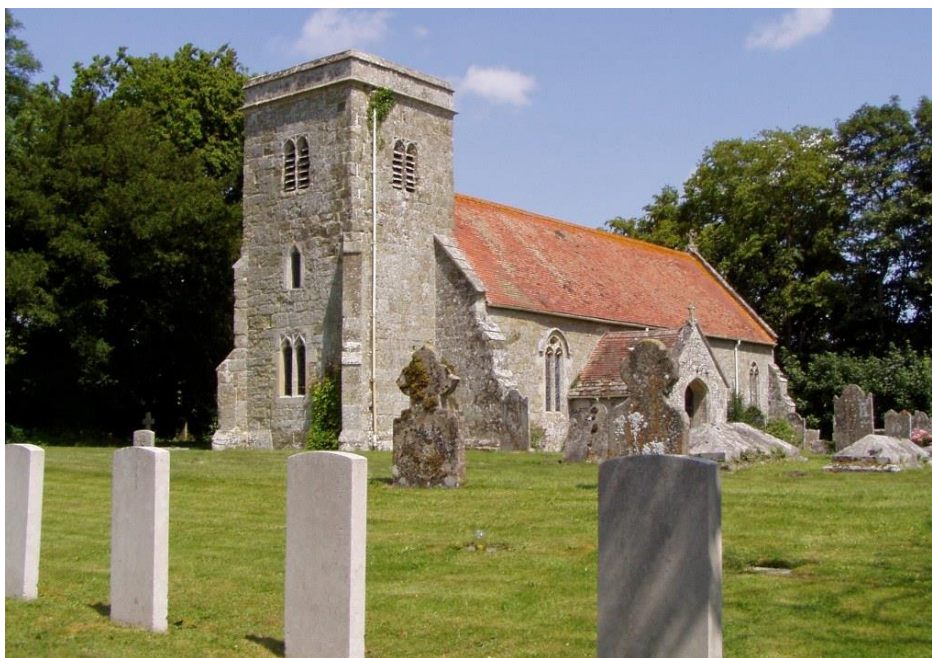
St. Edith's Churchyard, Baverstock, Wiltshire.