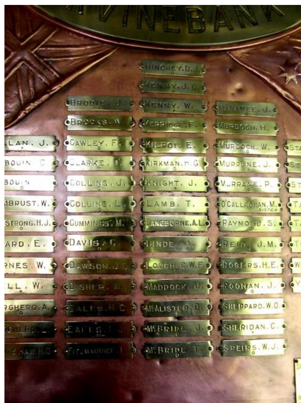
Irvinebank Roll of Honour