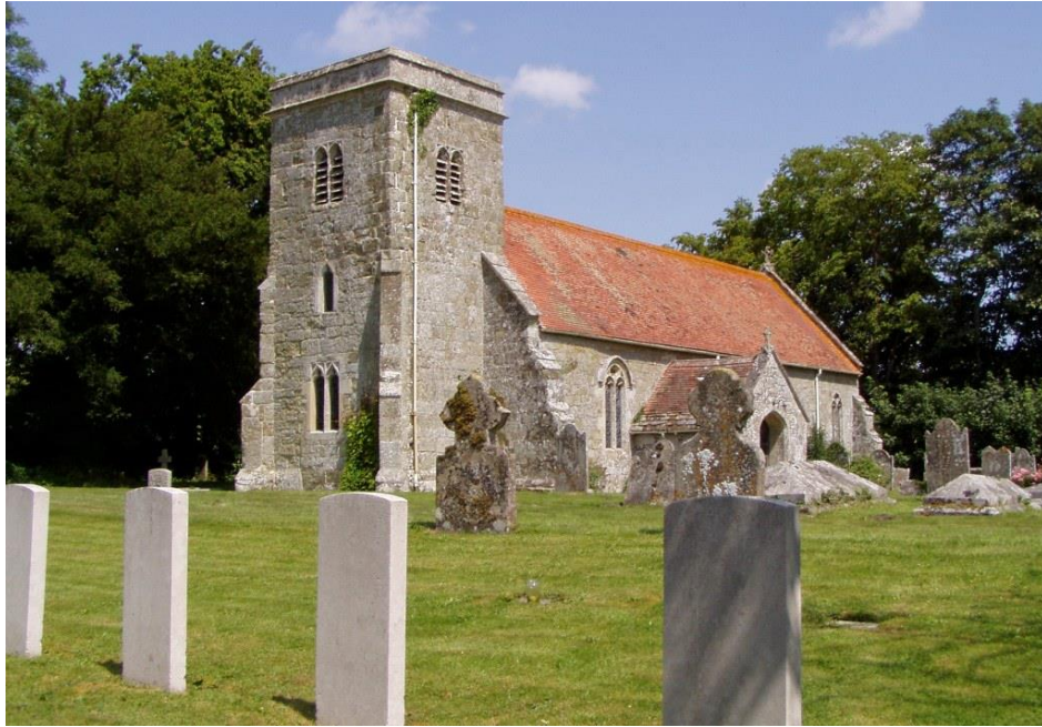
St. Edith's Churchyard, Baverstock, Wiltshire.