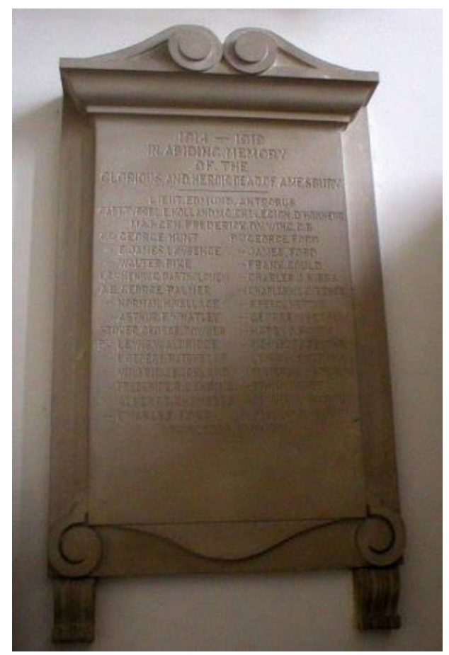
Abbey Church War Memorial, Amesbury