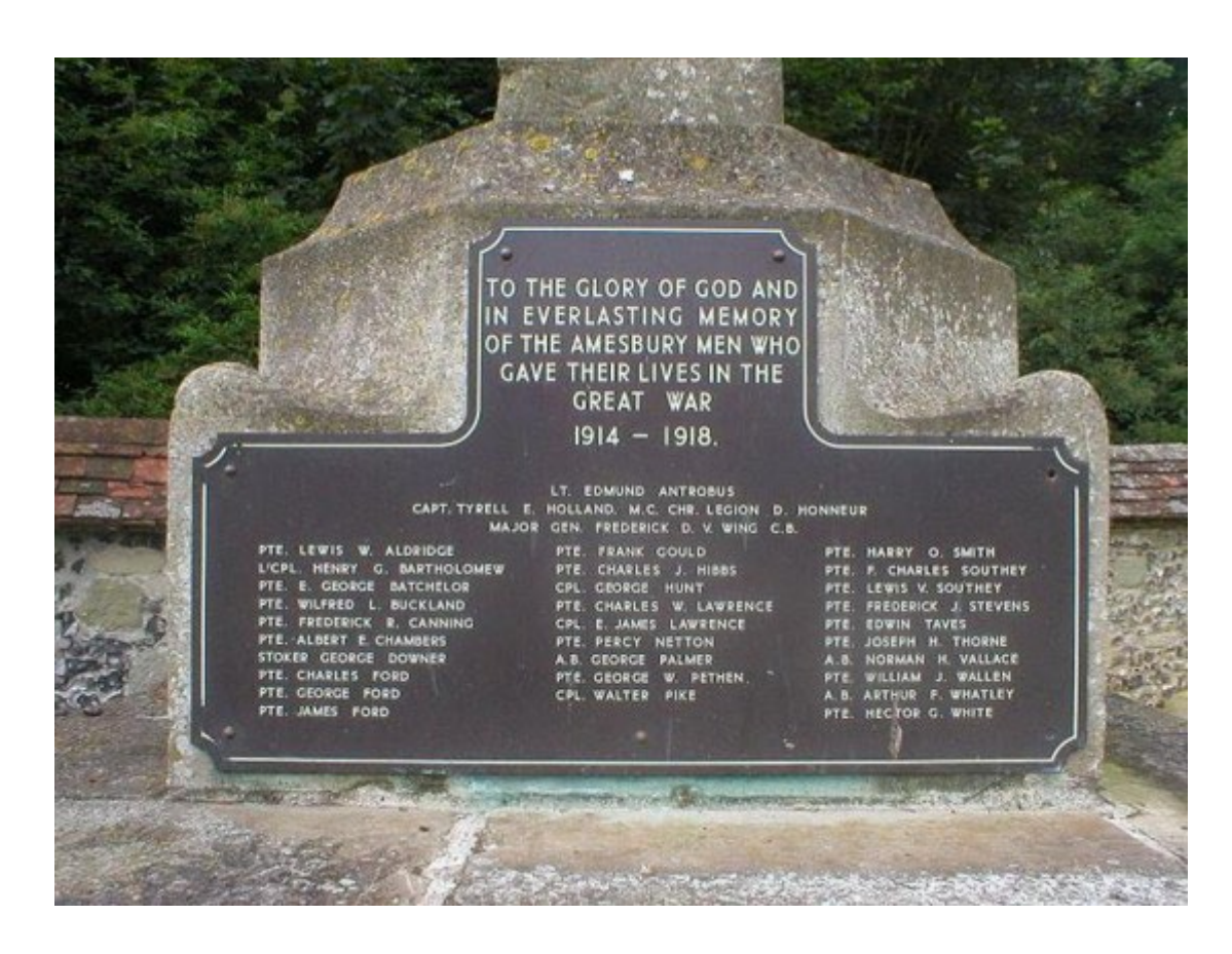
Amesbury War Memorial