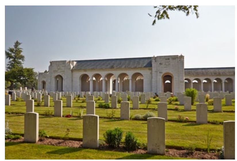
Le Touret War Memorial, Pas de Calais, France